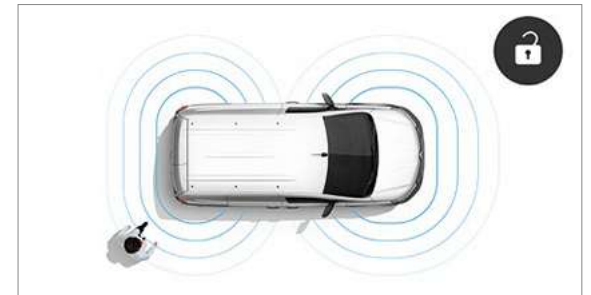
"zoning" function For locking or unlocking either the front doors or the loading area.